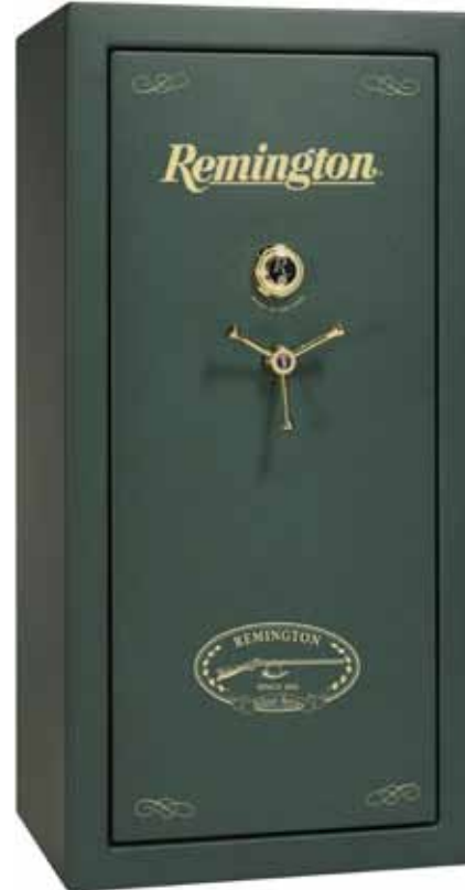
Silver 23 Available in Textured Green