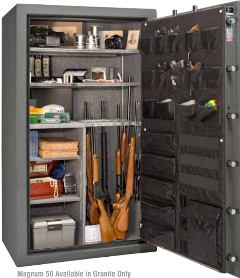
Magnum 50 Available in Granite Only

MAGNUM 50 GRANITE & SILVER 23 IN TEXTURED GREEN